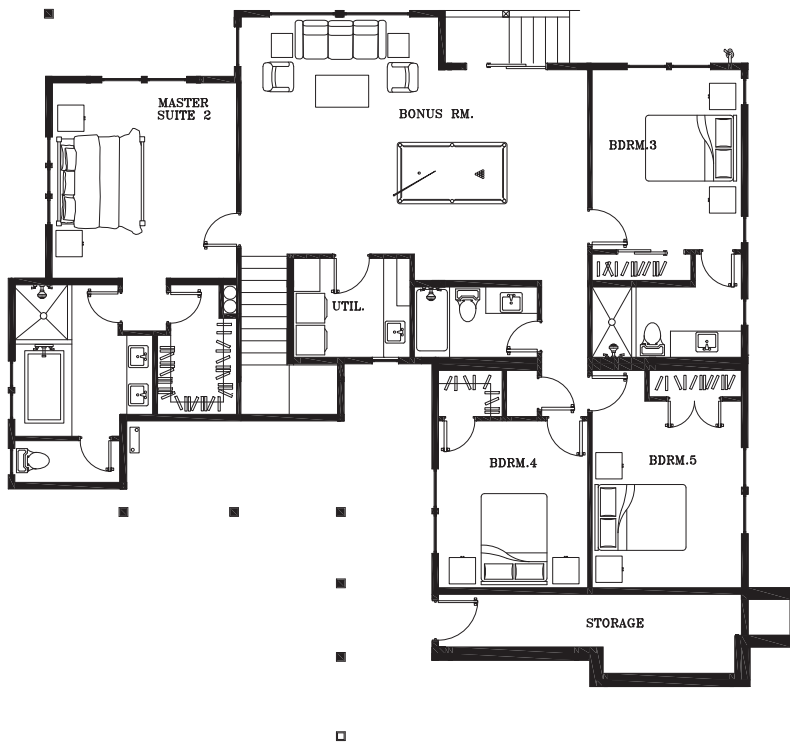
LOWER FLOOR PLAN — 1,862 sq. ft.